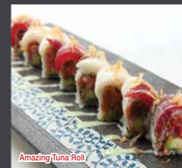
Amazing Tuna Roll