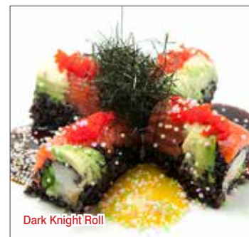
Dark Knight Roll

* Consuming raw or undercooked meats, poultry, seafood, shellfish, or egg may increase your risk of foodborne illness, especially if you have certain medical conditions